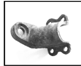
POWER STEERING CYLINDER BRACKET