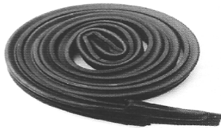
FITS FULLSIZE GM CARS- 2 DR HARDTOP